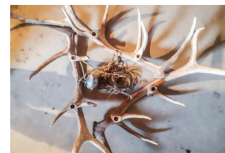
2 triangular elk horn chandeliers $500.00