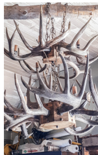
1 double-tiered WT chandelier $950.00