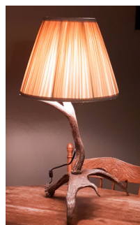
1 set of two table lamps $250.00

This is the last of my inventory, not taking any new orders, call Shawn at 403-594-4333.