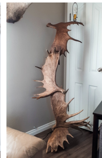
1 moose horn floor lamp $995.00